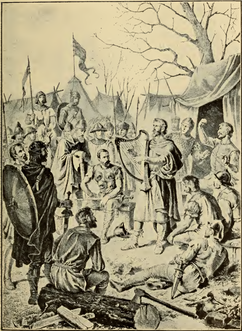
Alfred in the Danish camp.—Page 101. Alfred the Great.